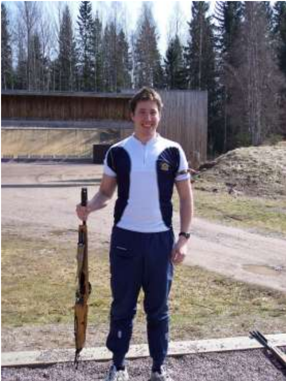
The only way of carrying the weapon at the shooting range

4) If the shooter does not fire ten (10) rounds, in each position, this will result in disqualification of the shooter from the competition.